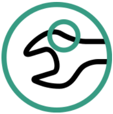
Offset Shaft Design