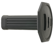
79160001 Finger protector