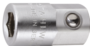
11180020 Bit holder