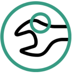
Offset Shaft Design