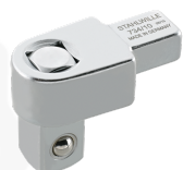
58240010 Square drive insert tool