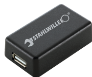
52110061 Interface adaptor