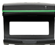
52110220 Bluetooth module für torque wrenches