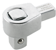
58240020 Square drive insert tool