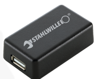
52110061 Interface adaptor