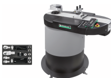
96521094 Automatic calibration and adjustment system