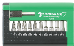
96080115 Bit box