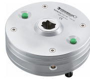
96524020 Transducer laboratory