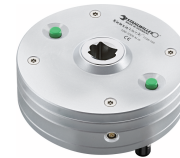
96524300 Transducer laboratory