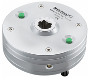
96524006 Transducer laboratory