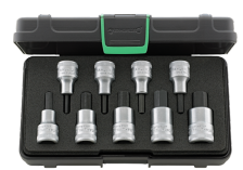
91332215 Screwdriver insert set