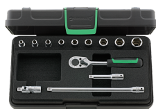
91221857 Socket spanner set