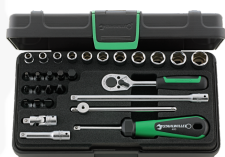
91222157 Socket spanner set