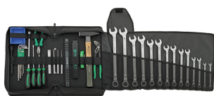
97830217 Agrar on-board tool set