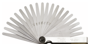
74240002 Precision feeler gauges