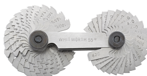
77270003 Screw pitch gauge