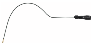
77260027 Magnetic lifter