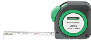
77040010 Tape measure