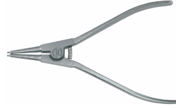
65454002 Circlip plier for outside circlips