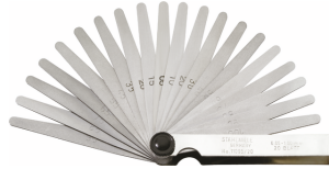
74240001 Precision feeler gauges