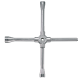
43030006 Wheel braces