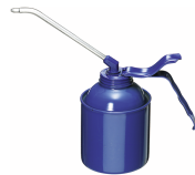
77010001 Force feed oil can