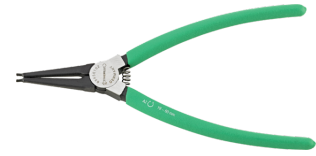
65456102 Circlip pliers for outer rings