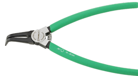
65466121 Circlip pliers for outer rings