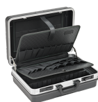
81620009 Tool box