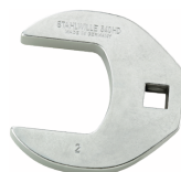
03501076 CROW-FOOT spanner heavy-duty inch