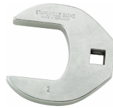
03501076 CROW-FOOT spanner heavy-duty inch