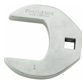
03501064 CROW-FOOT spanner heavy-duty inch