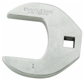
03501074 CROW-FOOT spanner heavy-duty inch