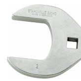
03501069 CROW-FOOT spanner heavy-duty inch