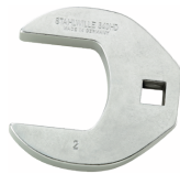
03501064 CROW-FOOT spanner heavy-duty inch