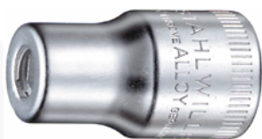
12180026 Bit holder