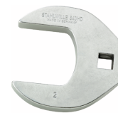
02501034 CROW-FOOT spanner heavy-duty inch