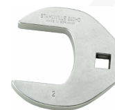
02501042 CROW-FOOT spanner heavy-duty inch