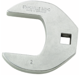
02501056 CROW-FOOT spanner heavy-duty inch