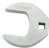
02501028 CROW-FOOT spanner heavy-duty inch