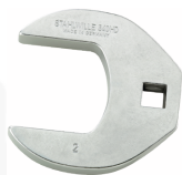
02501044 CROW-FOOT spanner heavy-duty inch