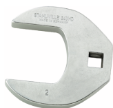
02501036 CROW-FOOT spanner heavy-duty inch