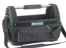
81620004 Tool bag