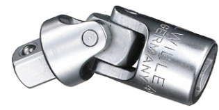
11020000 Universal joint