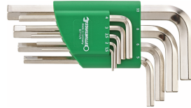
96431500 Set of hexagon key wrenches