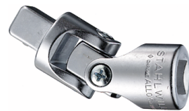
13020000 Universal joint