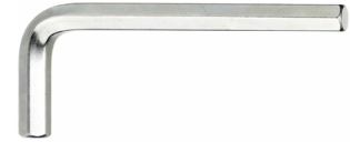
43153012 Hexagon key wrench