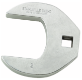
02501056 CROW-FOOT spanner heavy-duty inch