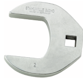
02501038 CROW-FOOT spanner heavy-duty inch