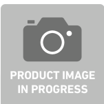
19020020 Spare parts set for ratchets