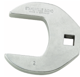
02501052 CROW-FOOT spanner heavy-duty inch