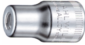
12180026 Bit holder