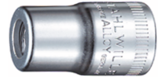
12180030 Bit holder