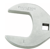
03501072 CROW-FOOT spanner heavy-duty inch