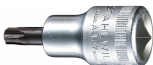
03100030 Screwdriver socket