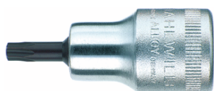
03100027 Screwdriver socket