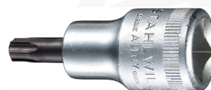
03100020 Screwdriver socket