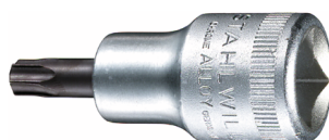
03100025 Screwdriver socket