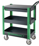
81300612 Service trolley