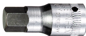
01120004 INHEX socket