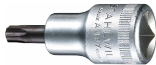
03100045 Screwdriver socket