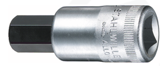
03050019 INHEX socket