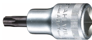
03100020 Screwdriver socket