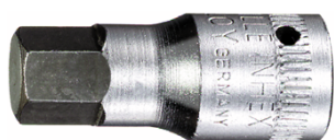
01120006 INHEX socket