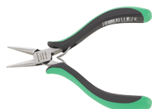
67116000 Electronic needle-nose pliers