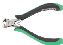
67106000 Electronic diagonal cutter