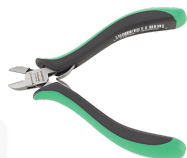
67086000 Mini electronic side cutter