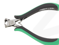
67096000 Electronic end cutter