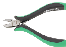
67076000 Electronic side cutter