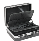
81620009 Tool box