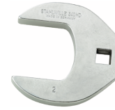
02501058 CROW-FOOT spanner heavy-duty inch