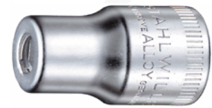
12180026 Bit holder