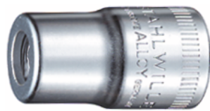
12180030 Bit holder