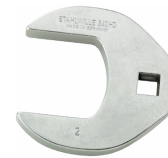
02501038 CROW-FOOT spanner heavy-duty inch