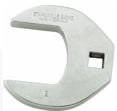
02501046 CROW-FOOT spanner heavy-duty inch