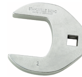
02501028 CROW-FOOT spanner heavy-duty inch