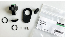
19021020 Spare parts set for ratchet No.435QR N