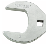
02501056 CROW-FOOT spanner heavy-duty inch