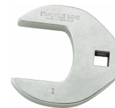
02501050 CROW-FOOT spanner heavy-duty inch