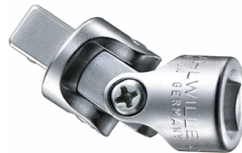
12020000 Universal joint