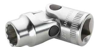
02040013 UNIFLEX socket