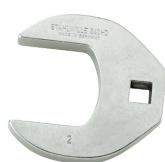
03501076 CROW-FOOT spanner heavy-duty inch