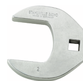
03501069 CROW-FOOT spanner heavy-duty inch