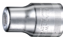
13180010 Bit holder