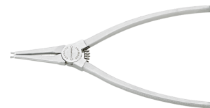
65454101 Circlip pliers for outer rings