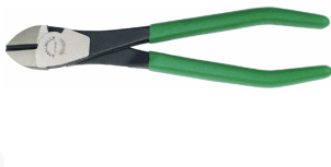
66026160 Heavy duty side cutter standard bevel