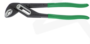
65516240 Waterpump plier