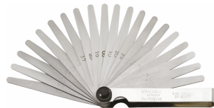
74240002 Precision feeler gauges