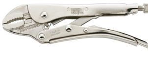
65642250 Self grip wrench