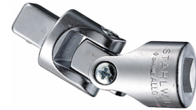
13020000 Universal joint