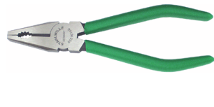
65016180 Combination plier