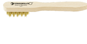
74160001 Spark plug brush