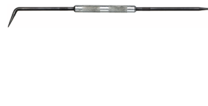
77100000 Scribing iron