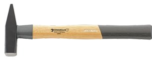
70110011 Engineers hammers