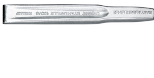
70010008 Ribbed cold chisel