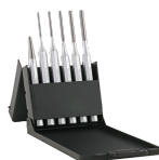
96700712 Pin punch-/centre punch set