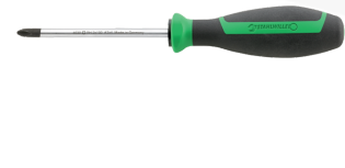
46303001 Cross-head screwdriver DRALL+