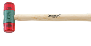
70160035 Plastic hammer