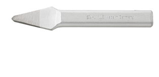
70040005 Cross-cut chisel