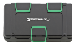
81251019 Socket set