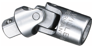
11020000 Universal joint