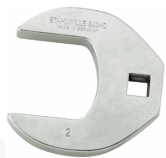
03501064 CROW-FOOT spanner heavy-duty inch