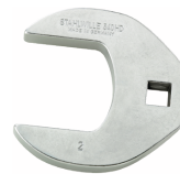
03501072 CROW-FOOT spanner heavy-duty inch