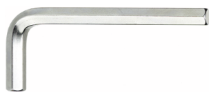
43153012 Hexagon key wrench