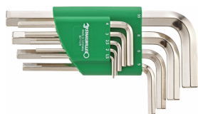
96431500 Set of hexagon key wrenches