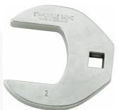
03501072 CROW-FOOT spanner heavy-duty inch