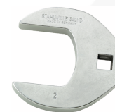
03501069 CROW-FOOT spanner heavy-duty inch