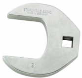
03501074 CROW-FOOT spanner heavy-duty inch