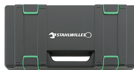
81251014 Socket set