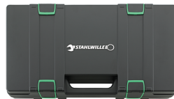
81271019 Socket set