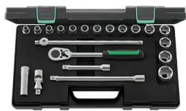
96031406 Socket set