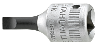
01280010 Screwdriver socket