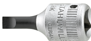
01280006 Screwdriver socket