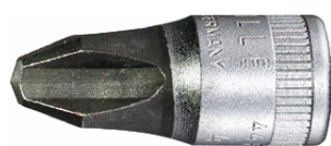
01290003 Screwdriver socket