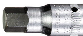
01120006 INHEX socket