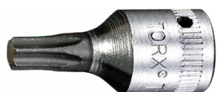
01350027 Screwdriver socket