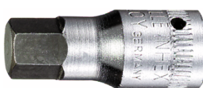
01120008 INHEX socket