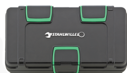
81251019 Socket set