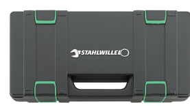
81251014 Socket set