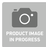
83022019 Hard foam inlay for socket set