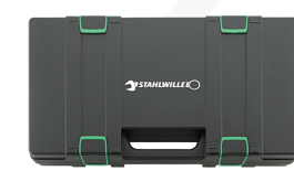
81271019 Socket set