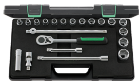
96031406 Socket set